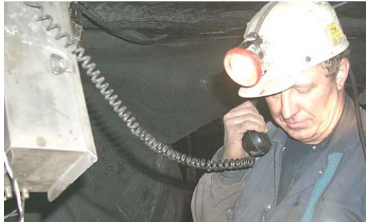
Timely notification can save lives

Adequate, well maintained escapeways are vital