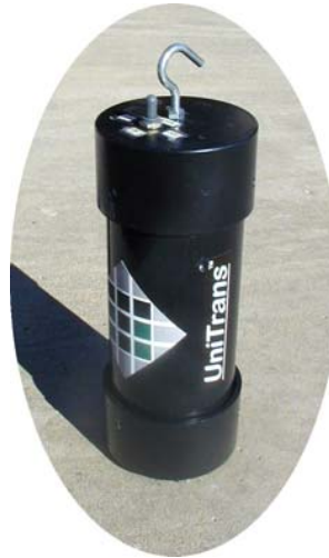
Optional UniTrans repeater for extended range between fresh air base and command center

Optional accessories allow team members to communicate hands-free, an option not available with older technology systems.