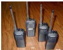
Mobile radio handsets for system access

UniTrans — Single repeater systems for small facilities.