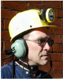
Optional throat microphone for hands-free operation

Optional repeater provides extended communication with command center.